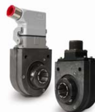
Avtron HS35M Magnetic Encoder

Reliance Electric selected the (RA)HS35M as their standard for new applications.